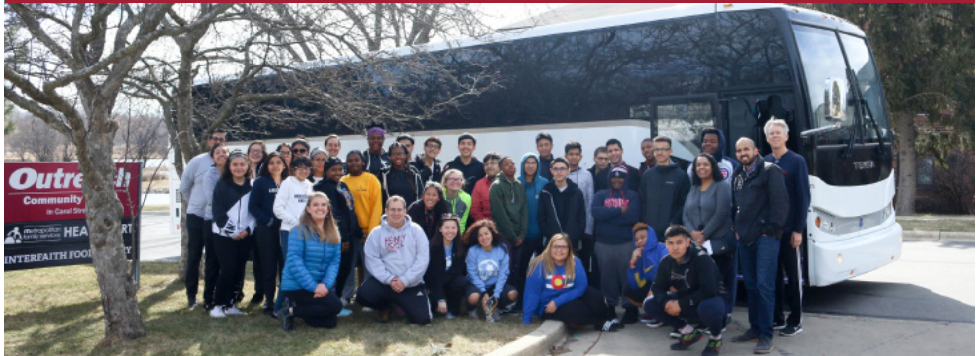
2018 Spring College Tour

leadership • student • learning • college • diploma • scholar • career • degree • alumni • training • knowledge • certificate • academia • honors • mentoring • leadership • student • learning